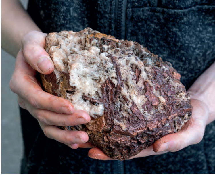
▲ Iron Ore from Clearwell Caves, Coleford