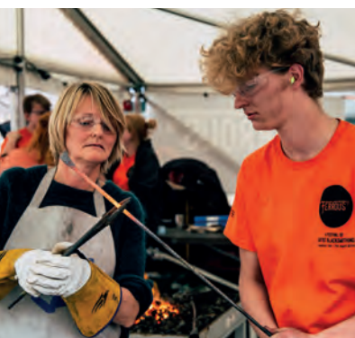
▲ Public Forging

Ever wanted to have a go at forging? Here's a chance to book a slot and hammer some hot metal yourself! The festival brings forges to High Town, each run by an experienced artist blacksmith who will guide you through the process. If you haven't booked your forging slot in advance (booking link at www.ferrousfestival.co.uk ), there may still be slots available on the day, so come along to the forge area in High Town to ask.