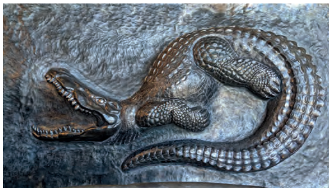
▲ Douglas Pryor

and designers working in metal from all over the world. It's an internationally facing festival, with an ethos of inclusive practice that you can't see anywhere else, and it's also an opportunity for our students to reach out to the community and to contribute. It's a chance to teach, to inspire, to participate, and to make a difference through making."