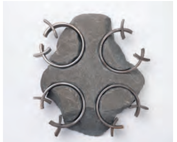
▲ Egor Bavykin, Image: Oliver Cameron-Swan