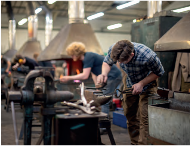
▲ Forging